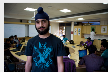
An AES student teaches computer skills to the camp kids