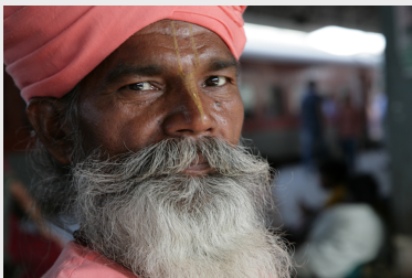
A man waits for a train at the New Delhi railway station