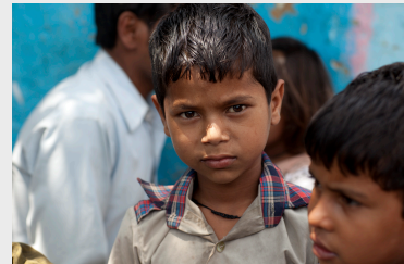
A school child from the camp across from AES