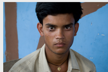
A boy visiting the SBT clinic at the train station